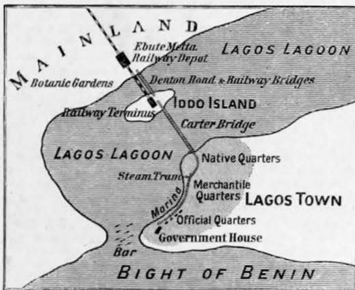
Fig. 1—LAGOS TERMINUS

The following are a few particulars of the Carter